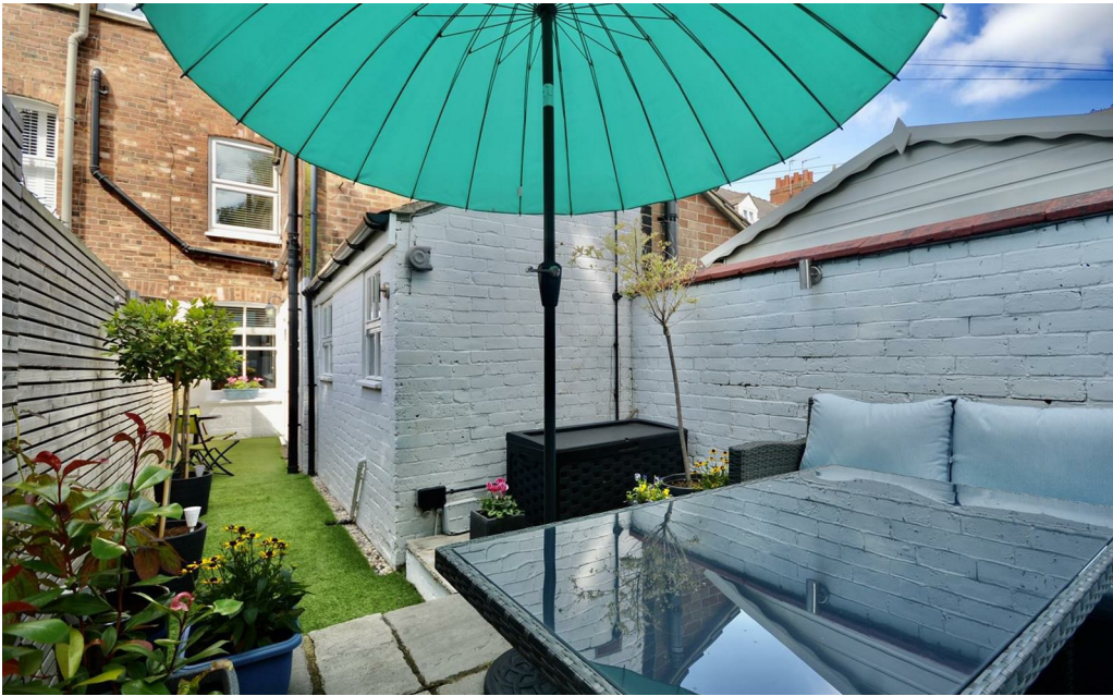
65, Bailgate, Lincoln